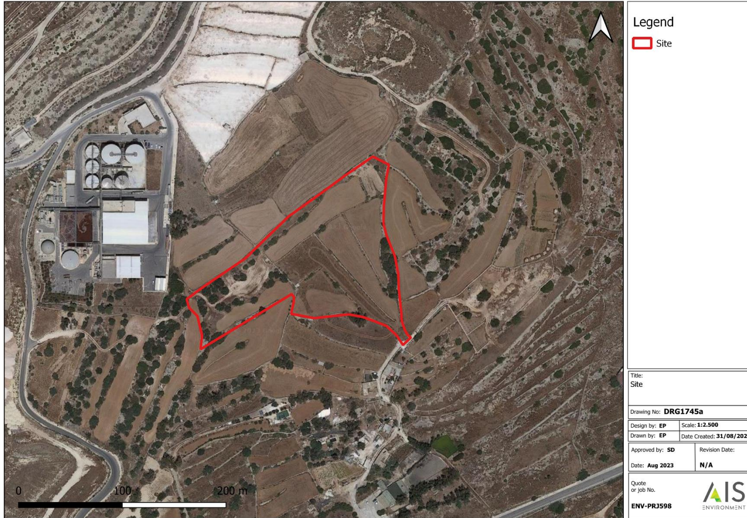
FIGURE 1: PROPOSED SITE FOR THE NEW THERMAL TREATMENT FACILITY (TTF)