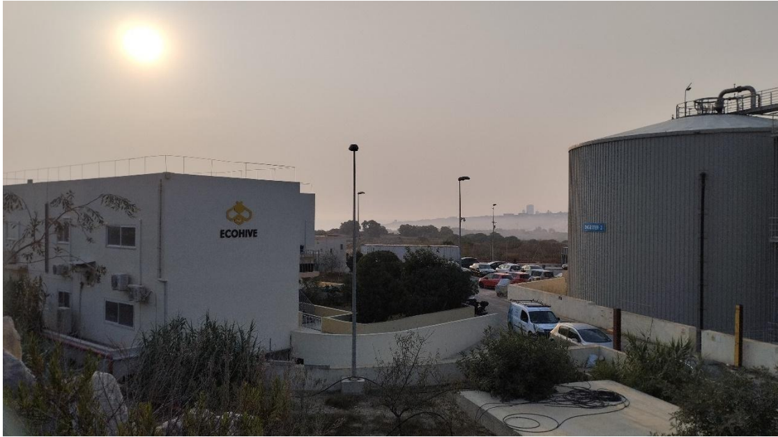
FIGURE 3: STREET LIGHT AROUND THE EXISTING ECOHIVE COMPLEX BUILDINGS