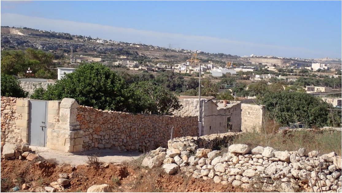
FIGURE 5: GO MOBILE AERIAL CABLES WITHIN THE AOI