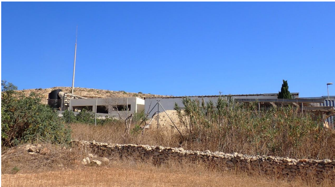
FIGURE 4: BOUNDARY WALL AND FENCING AROUND THE EXISTING ECOHIVE FACILITY BUILDINGS