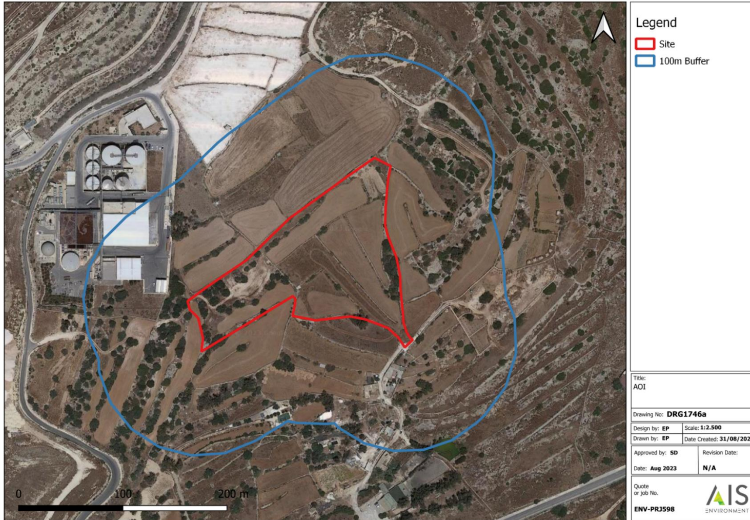
FIGURE 2: AREA OF INFLUENCE FOR THE INFRASTRUCTURE AND UTILITIES STUDY